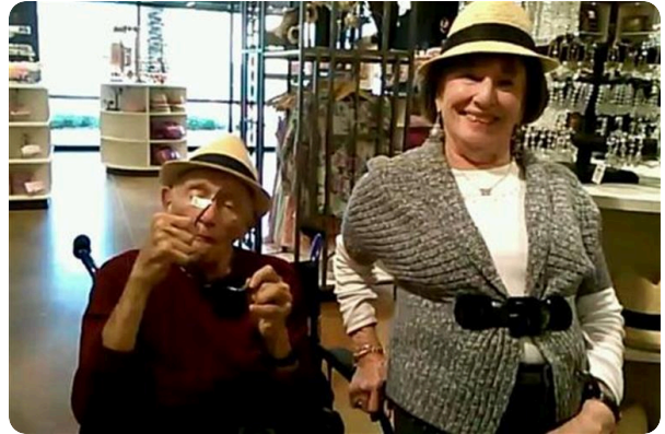
Ya we look Good. Always having fun no matter what we did...