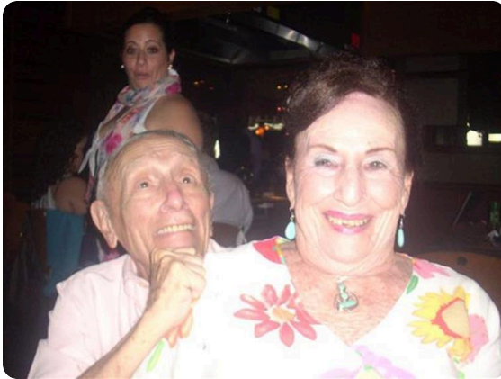
I said I could handle you... Papito & Mamita Having fun