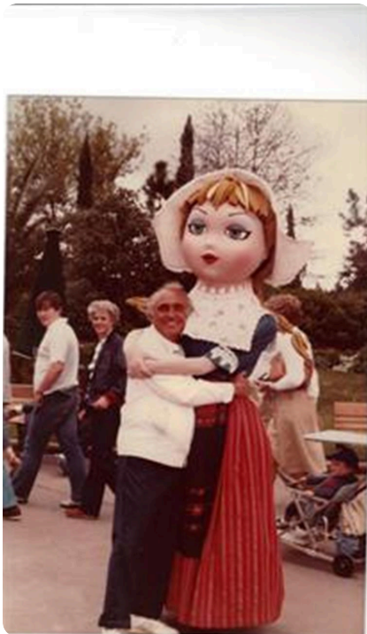
Hay T his was my girl to o... Always joking!!!