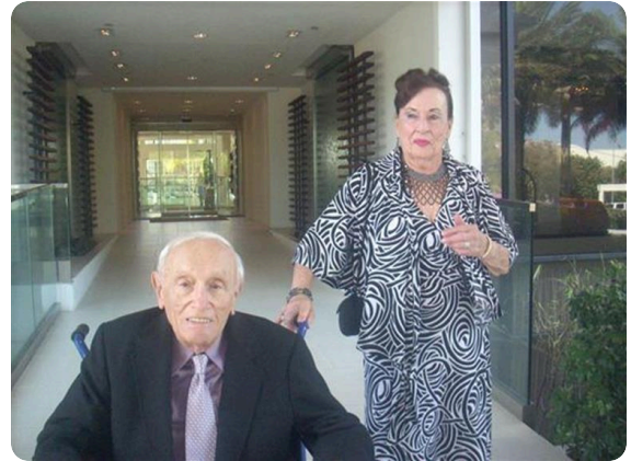
Come on Girl lets get The Party Started...Papa ready to GO.